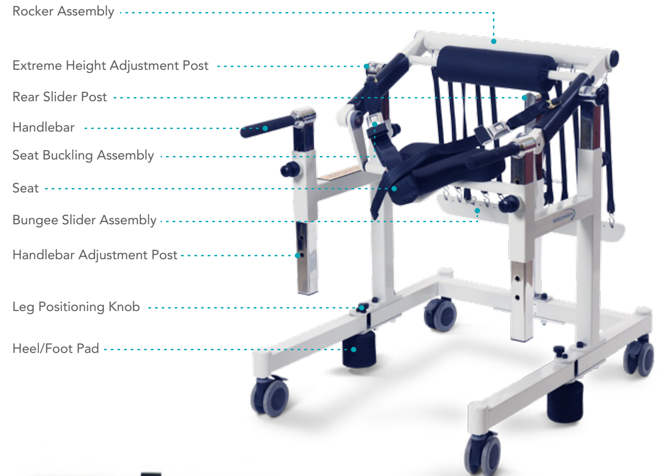
FIGURE 1: BUNGEE MOBILITY TRAINER